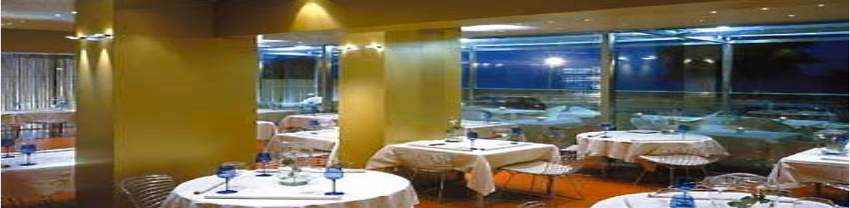
LA MADONNINA DEL PESCATORE RESTAURANT - SENIGALLIA, AN. ITALY