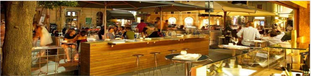
ANIKÒ SALUMERIA ITTICA - SENIGALLIA, AN. ITALY