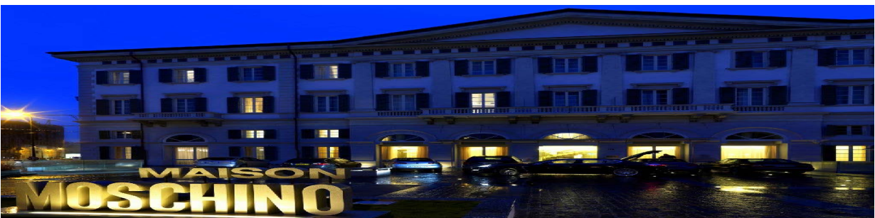
CLANDESTINO - MAISON MOSCHINO, MILANO. ITALY