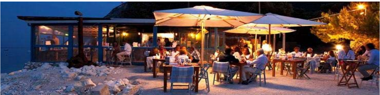
CLANDESTINO SUSCI BAR - PORTONOVO, AN. ITALY